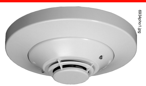
FSP-851 with B710LP base