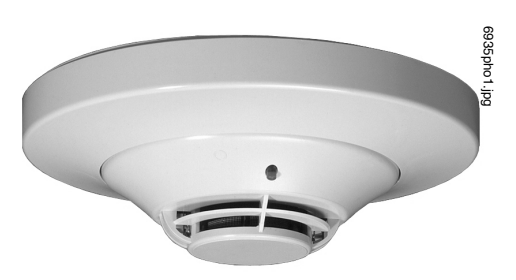
FSP-851T with B710LP base