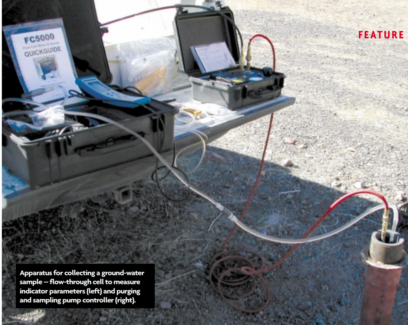
Apparatus for collecting a ground-water sample – flow-through cell to measure indicator parameters (left) and purging and sampling pump controller (right).