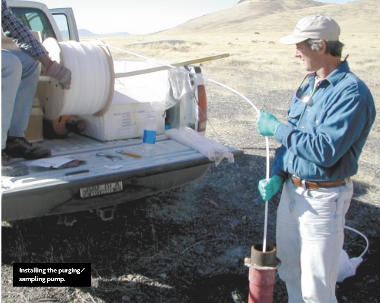
Installing the purging/ sampling pump.