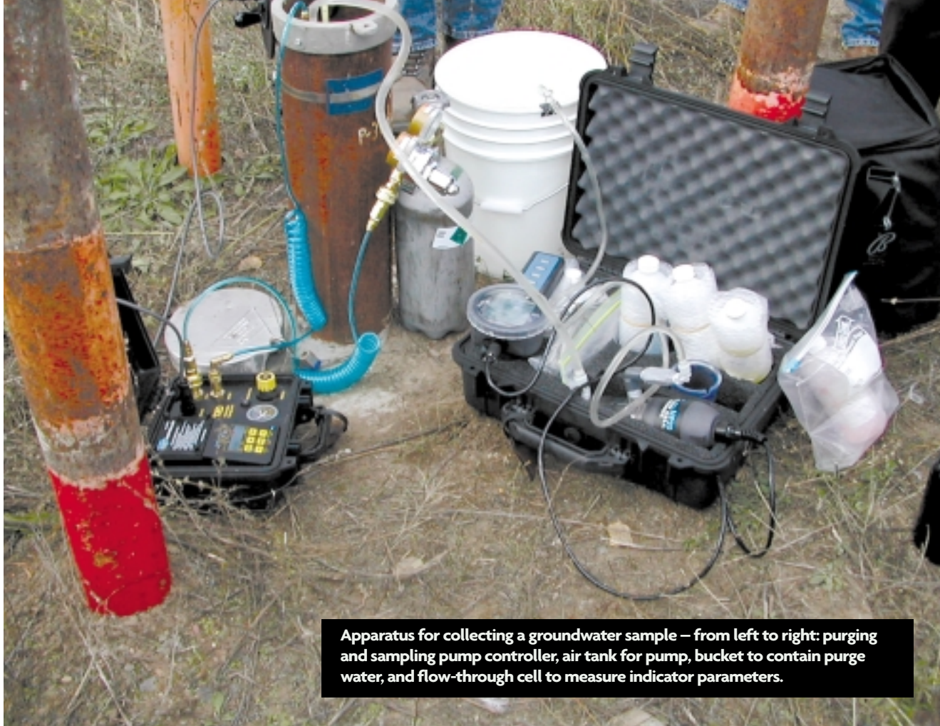
Apparatus for collecting a groundwater sample – from left to right: purging and sampling pump controller, air tank for pump, bucket to contain purge water, and flow-through cell to measure indicator parameters.

nant” water from the well so that representative ground water is sampled.